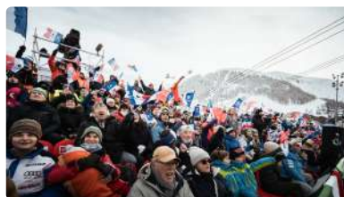
GENERAL PUBLIC TICKETING