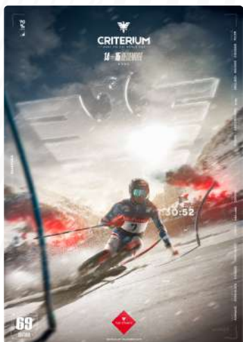
DOWNLOAD THE 2024 POSTER