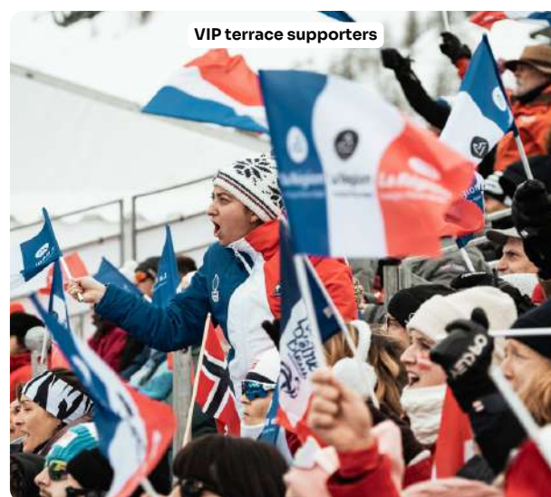
VIP terrace supporters

Friday & Saturday from 5:45 PM to 7:15 PM - Closure of l'Avenue Olympique between the two roundabouts.