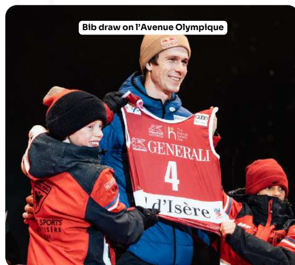
Bib draw on l'Avenue Olympique